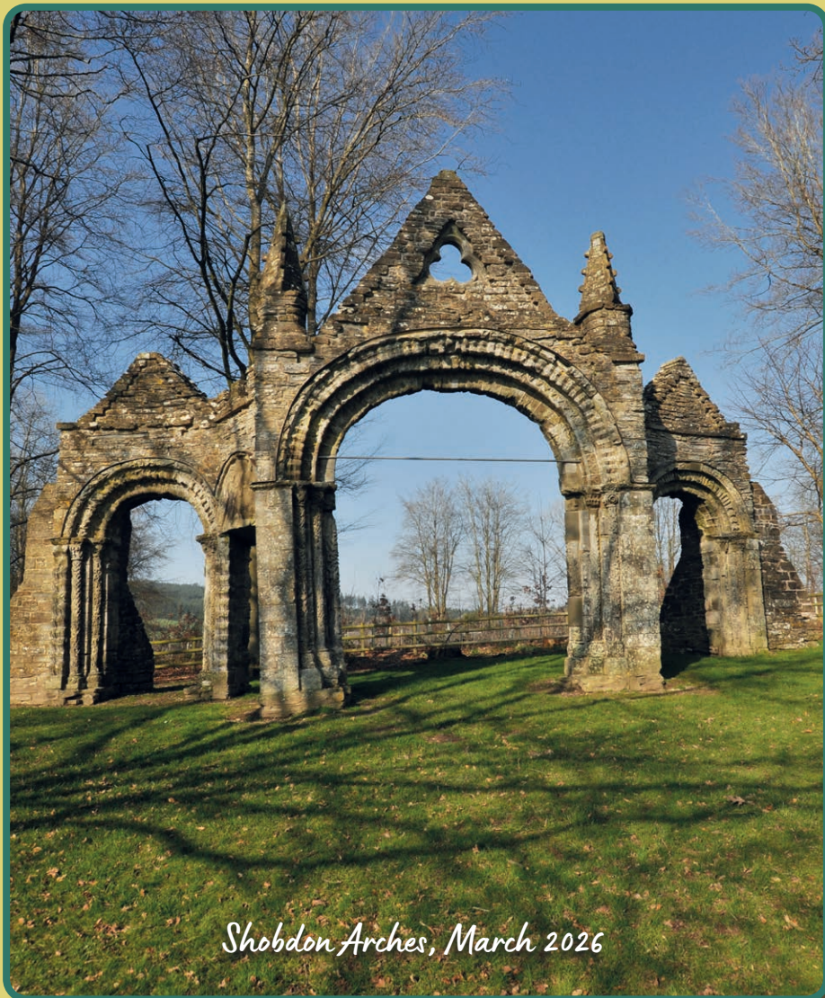
Shobdon Arches, March 2026

Service details and magazine content available on-line at www.arrowvalechurches.org.uk